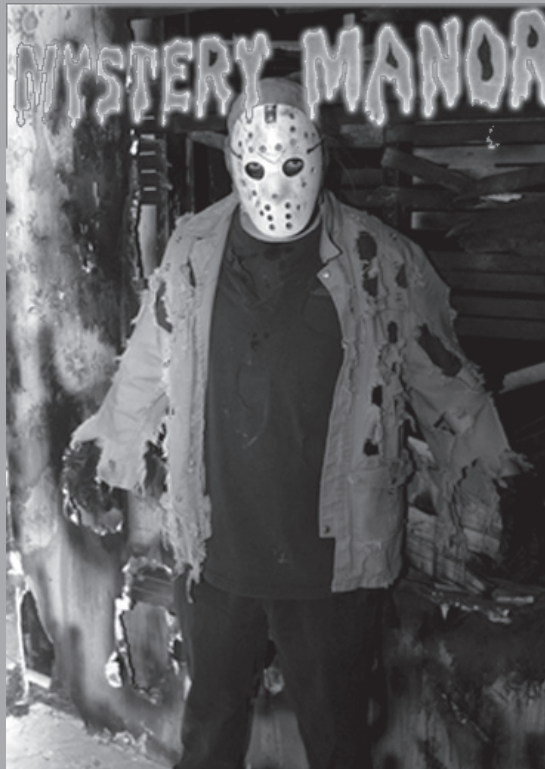
Mystery Manor's very own Jason strikes fear into anyone who crosses his path